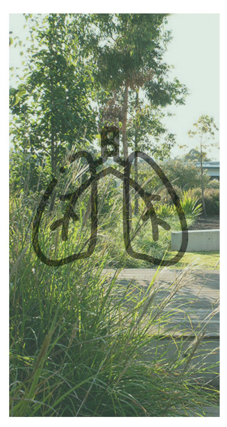
Outdoors and Wellbeing

Gardens and access to fresh air, sunlight and natural light contribute to health and wellbeing. By prioritizing natural elements, we can focus on a beneficial relationship between the outdoor environment and its inhabitants.