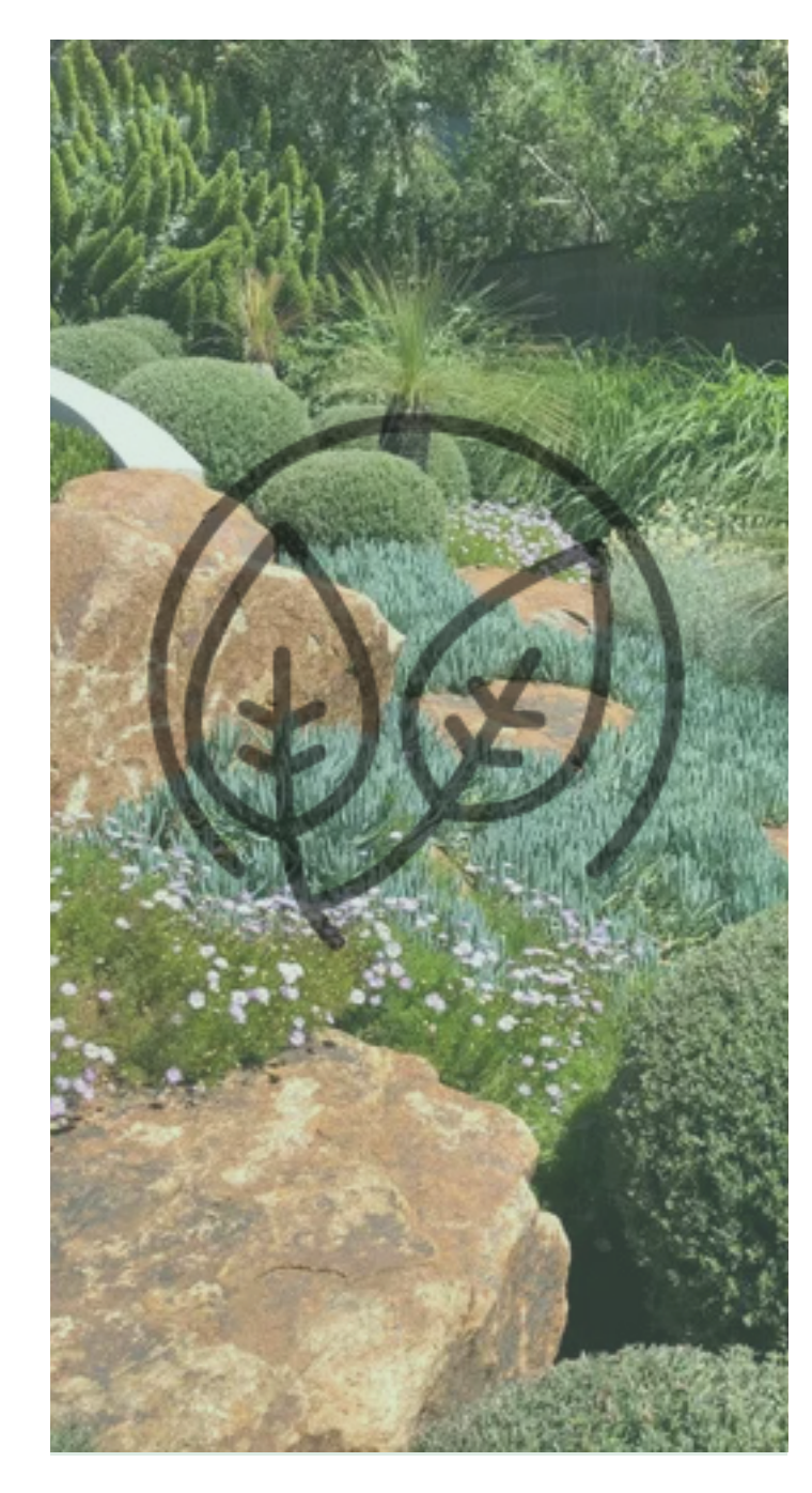
Coastal and Native

Creating peacful and relaxing outdoor spaces for people to compliment the function of the healthcare facilty.